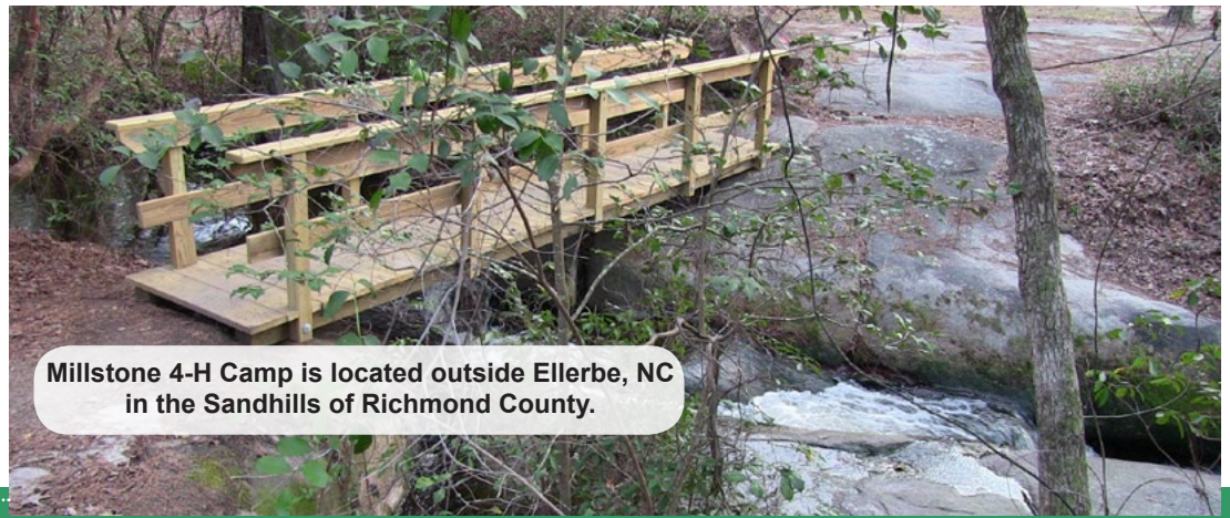
Millstone 4-H Camp is located outside Ellerbe, NC in the Sandhills of Richmond County.

Come enjoy the Millstone Experience. Rustic charm with modern amenities makes it the perfect location for your next meeting or retreat.